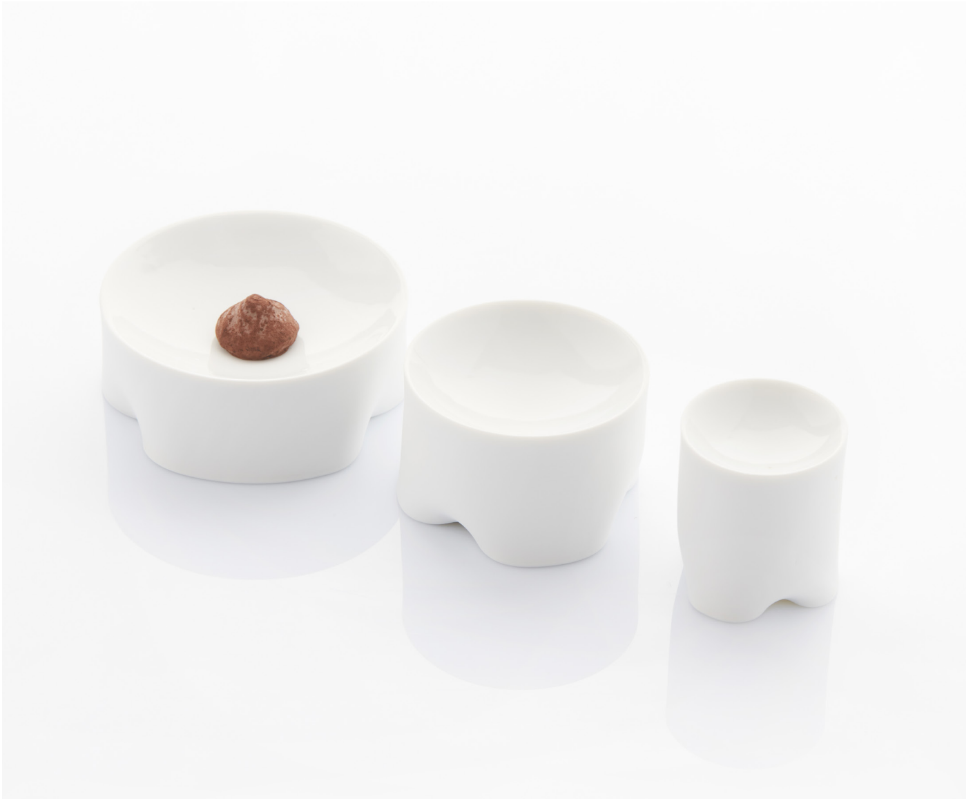
611_SEDES plate flat round Ø11 H05 white 611_SEDES plate flat round Ø09 H06 white 611_SEDES plate flat round Ø06 H07 white by Frank Claesen