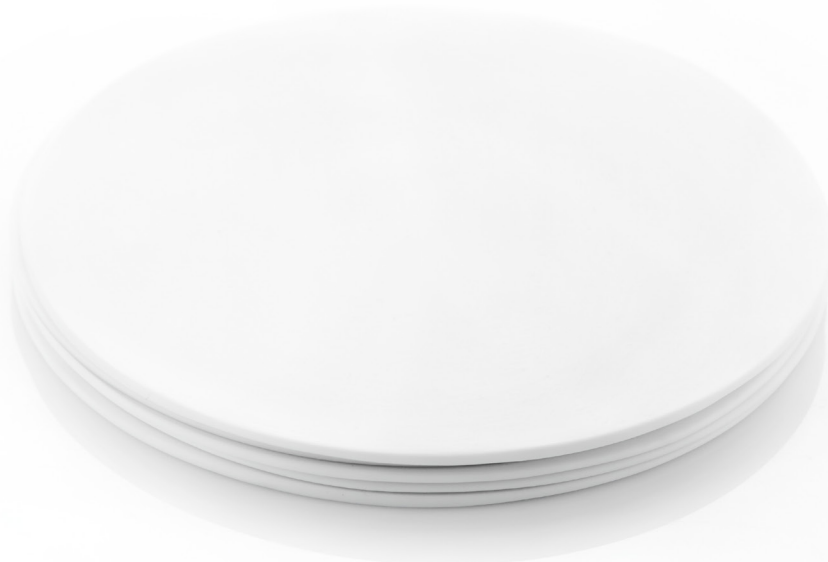
204_STILL plate flat 5 layers round Ø13 H01 white by Pieter Stockmans (available in April)

C-MINE 100 BUS 2 3600 GENK | BELGIUM T +32(0)89382362 E info@studiostockmans.com www.studiostockmans.com|openbyappointment