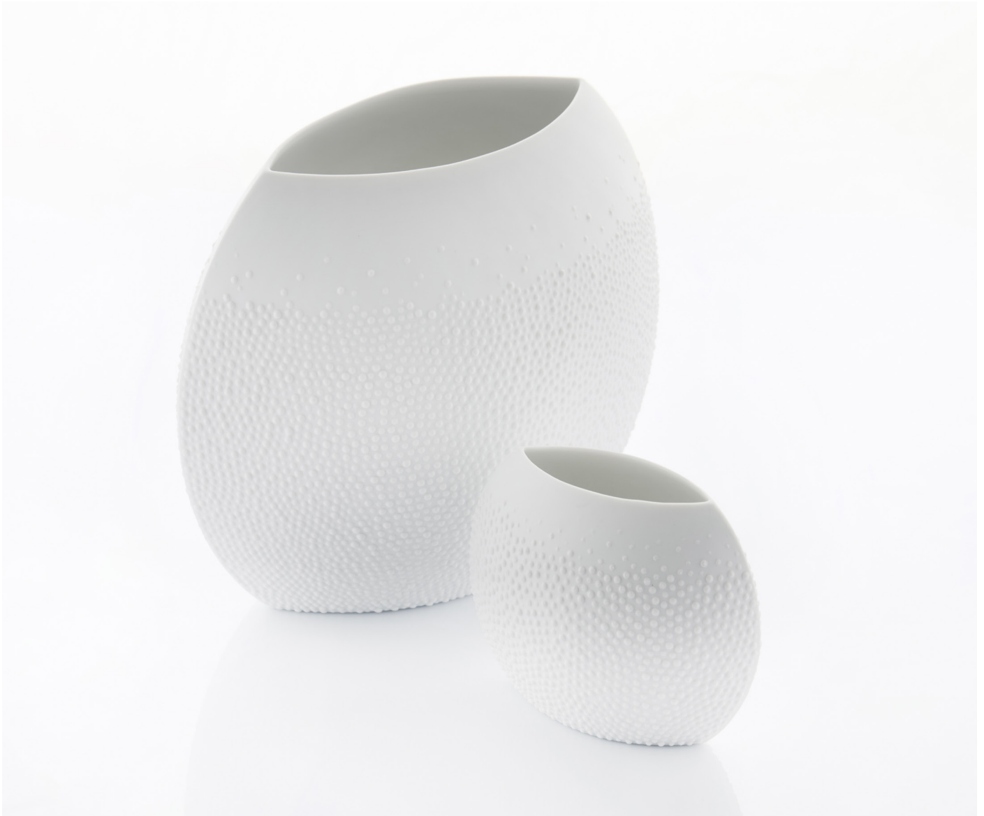
256_DAUW vase oval 14x08 H10 white 256_DAUW vase oval 24x16 H20 white by Frank Claesen

C-MINE 100 BUS 2 3600 GENK | BELGIUM T +32(0)89382362 E info@studiostockmans.com www.studiostockmans.com|openbyappointment