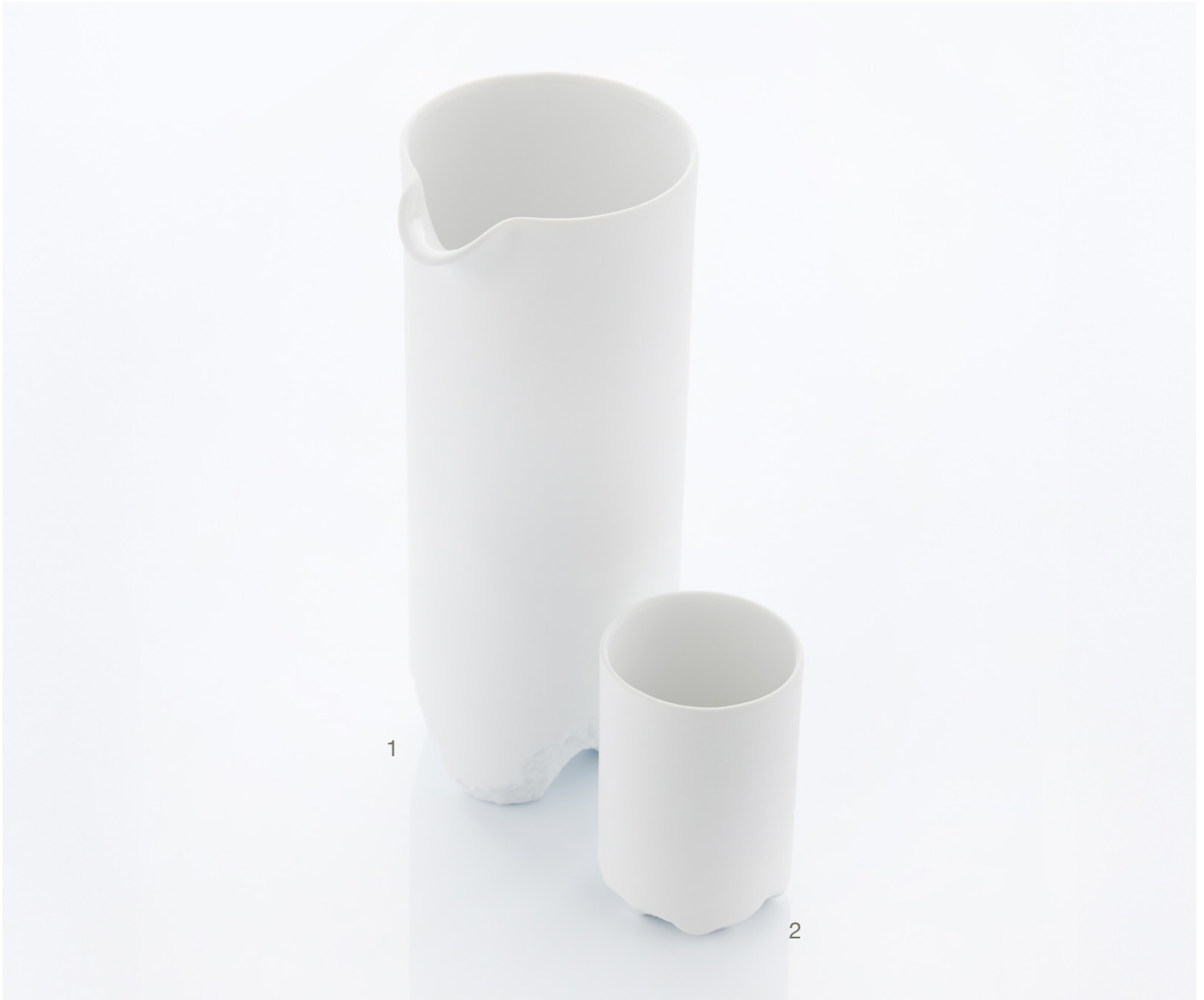
1_MOUNTAIN carafe round Ø09 H20 white 2_MOUNTAIN beaker round Ø06 H08 white by Frank Claesen

C-MINE 100 BUS 2 3600 GENK | BELGIUM T +32(0)89382362 E info@studiosstockmans.com www.studiosstockmans.com|openbyappointment